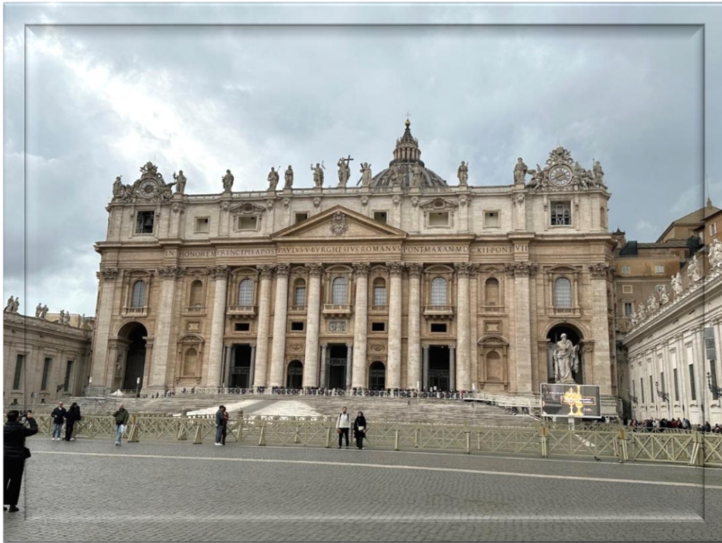
The outside of St. Peter's Basilica during the day.