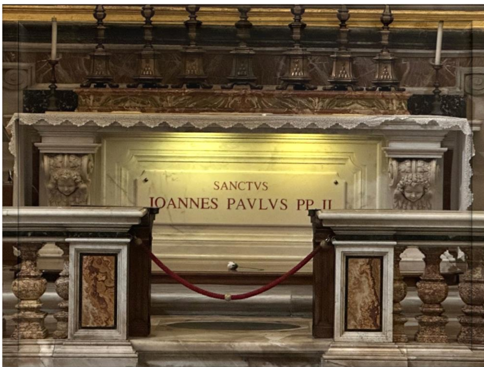
The tomb of St. Pope John Paul II located inside St. Peter's Basilica.