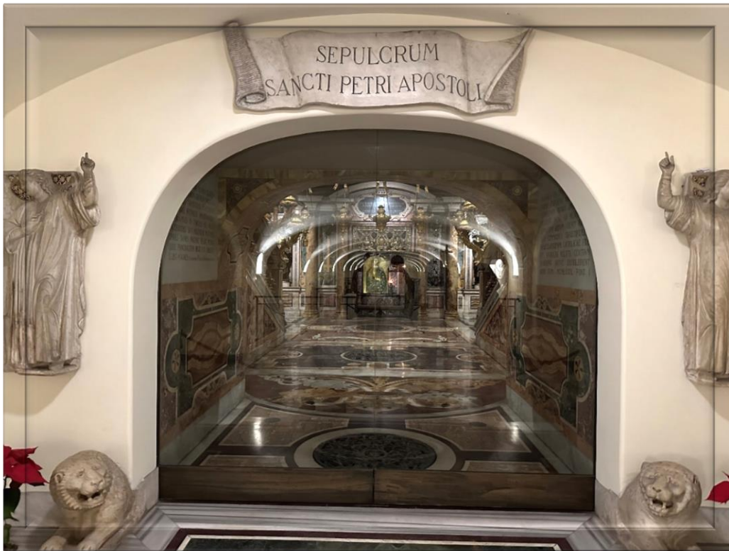
The tomb of St. Peter.

Attending the General Audience with Pope Francis. We were sitting about six rows from the front of the stage where Pope Francis was seated.