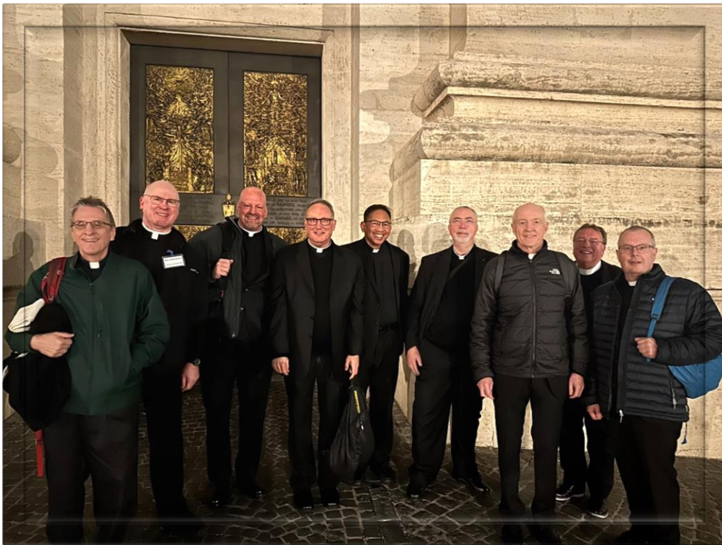
Part of our priests' group waiting to enter a side door of St. Peter's Basilica to pray Mass in the crypt where St. Peter's body is buried.