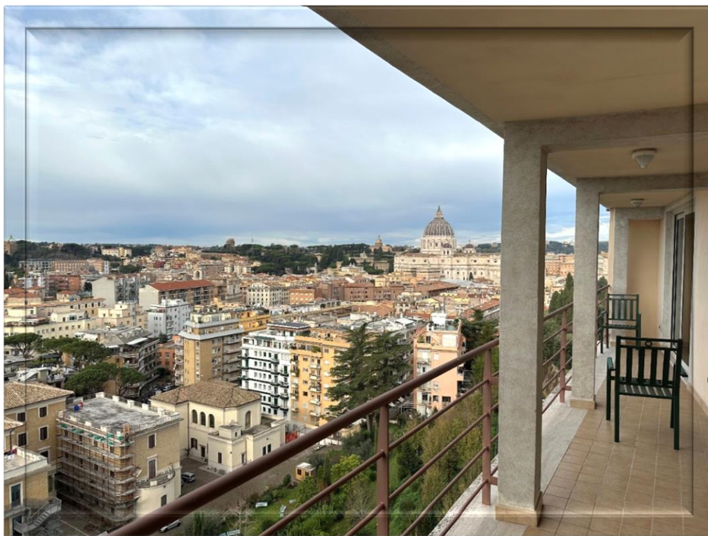
The balcony off my room at the priests' residence. You can see the dome of St. Peter's Basilica in the background. We are about a ten-minute walk from St. Peter's Square.

P.S. I have included some pictures below.