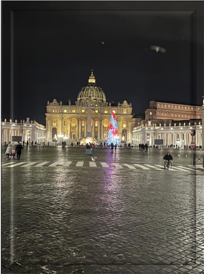
St. Peter's Basilica and St. Peter's Square at night.