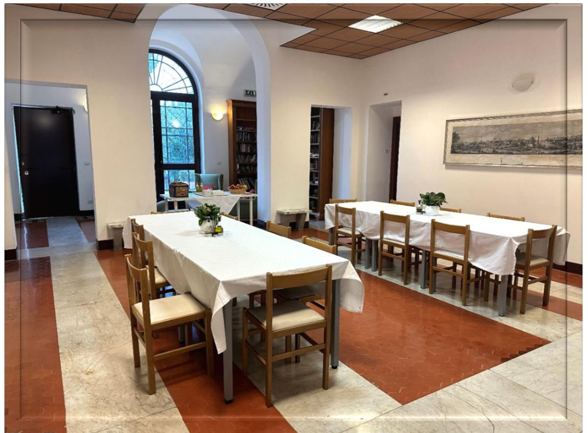
The dining room at our residence.