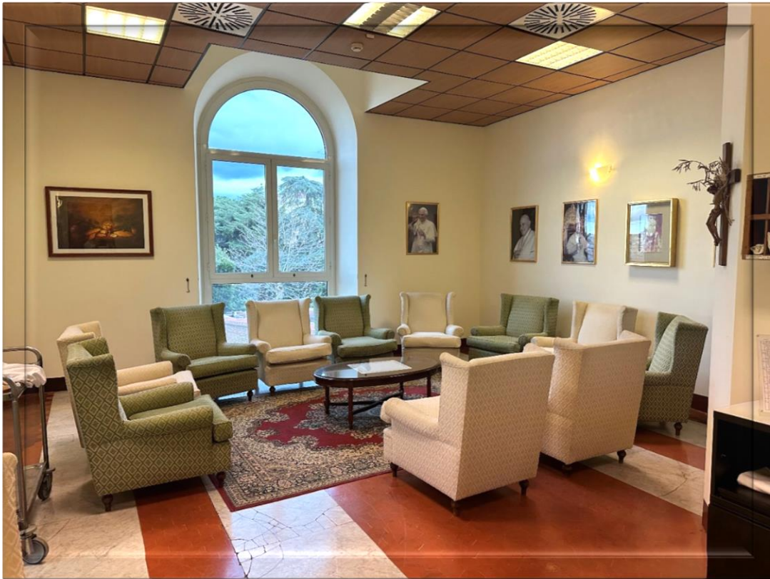
The socializing room at our residence.